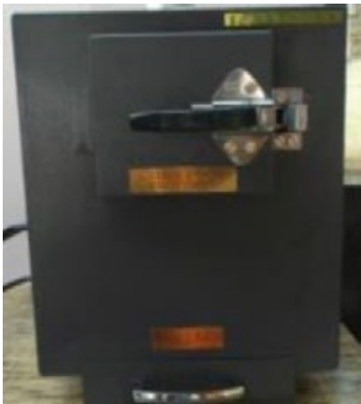
Easyburn Analogue OTHEB515