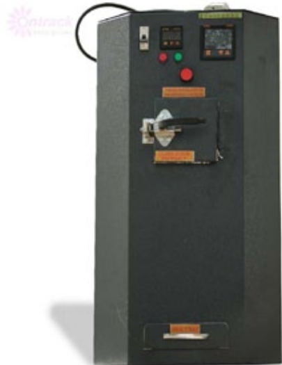
Easyburn Large THEB511