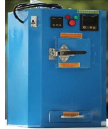
Easyburn Medium OTHEB512