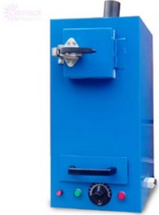
Easyburn Compact OTHEB522