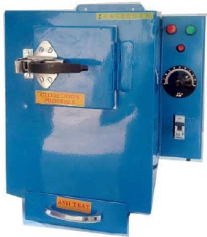
EasyBurn Destroyer OTHEB524