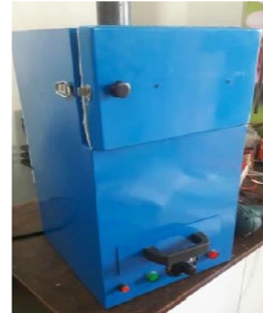
Easyburn Compact OTHEB525