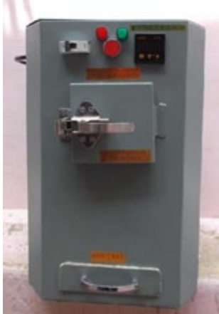
Easyburn Small OTHEB513