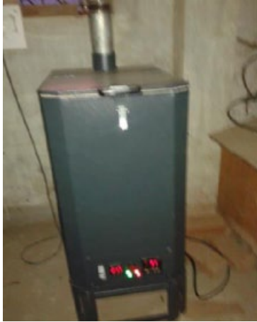
Easyburn Top Loading OTHEB601