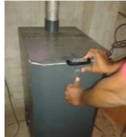
Easyburn Manual OTHEB516