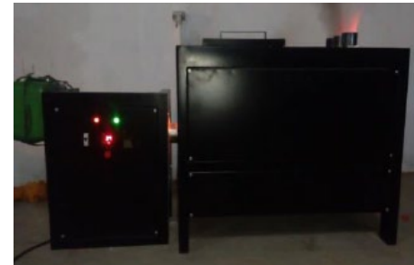
Easyburn Diapper Destroyer OTHEB883