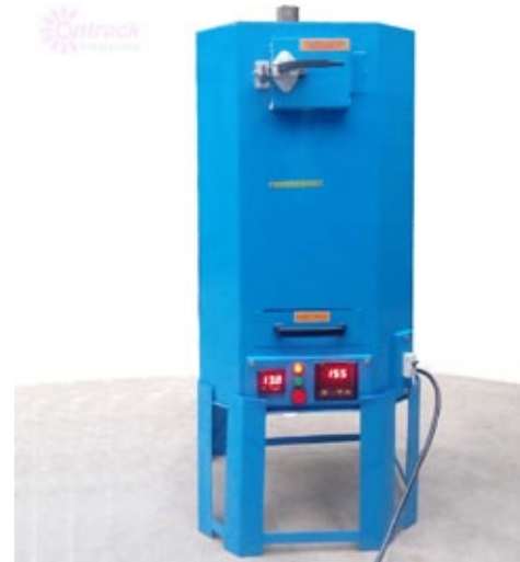
Easyburn Big OTHEB523